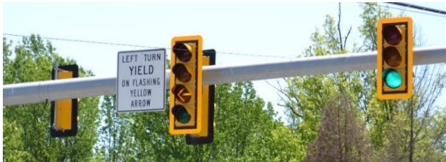
Flashing Yellow Arrow Installation in Virginia

VDOT works hard to provide a roadway network that operates safely, efficiently, and effectively. In 2019, the Commonwealth Transportation Board approved the deployment of highly effective, low-cost safety improvements to help reduce serious injury and fatal crashes across the Commonwealth. This data-driven strategy focuses on proactively targeting locations with higher crash risk. The goal is not to wait for crashes to occur before we proactively treat high-risk locations on the roadway network!